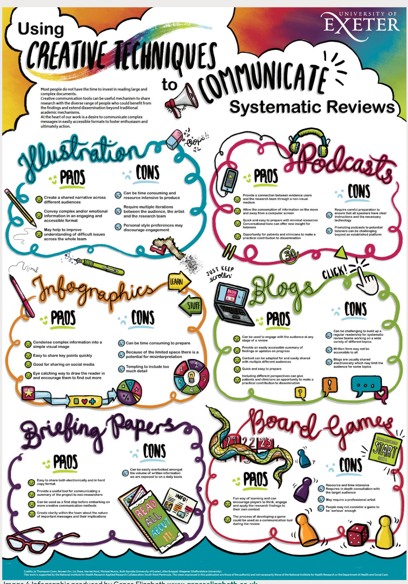
Image 4 Infographic produced by Grace Elizabeth www.graceelizabeth.co.uk